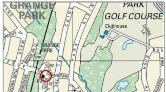
Grange Park Office